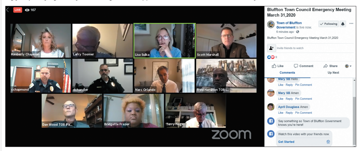
Bluffton councilmembers and staff gather in a virtual emergency meeting.

Before the first virtual council meeting in April, the town staged a practice meeting online to acclimate everyone to the process. Vance noted that this helped limit the potential for technical difficulties, and