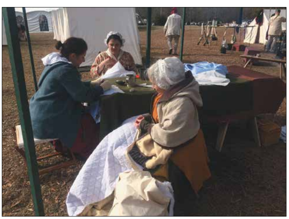
The Cowpens National Battlefield attracts history buffs, visitors researching their ancestors and Revolutionary War re-enactors, such as these women in period attire.

The efforts of South Carolina's cities and towns have caught the attention of the state's top tourism official. Cities in South