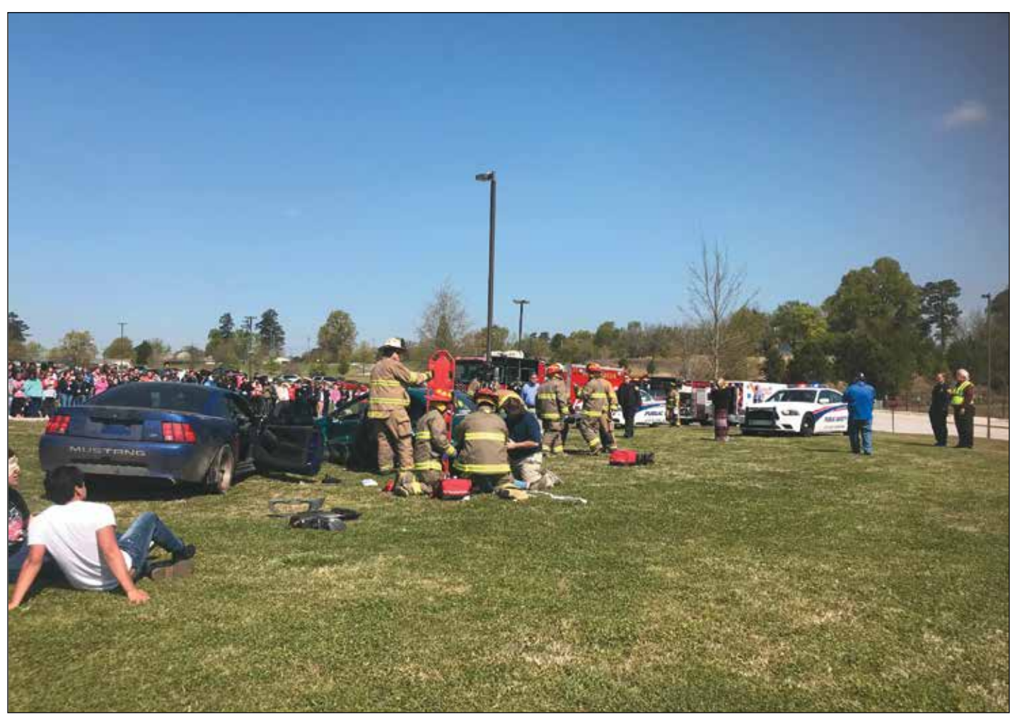
The City of Clinton partnered with Clinton High School and other agencies to teach teens about the dangers of distracted driving.

A show-and-tell approach also helps convey lifesaving information in the City of Hardeeville and Town of Bluffton.