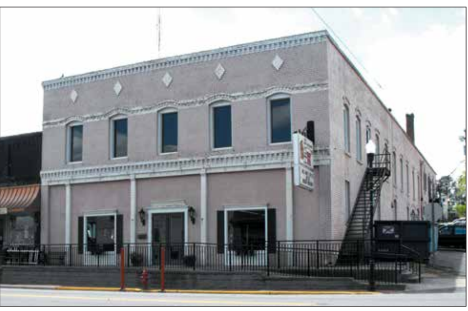
The Town of Saluda worked with a downtown property owner to convert his building into residential units for teachers.

He said it's hard to tell if there was a direct cause-and-effect correlation, but