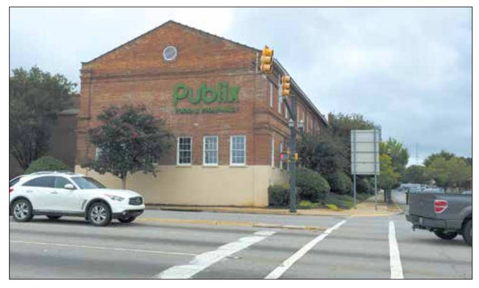
The Confederate Printing Plant in Columbia was built in 1864 to print Confederate bonds, but today it houses residential units and a Publix grocery store.