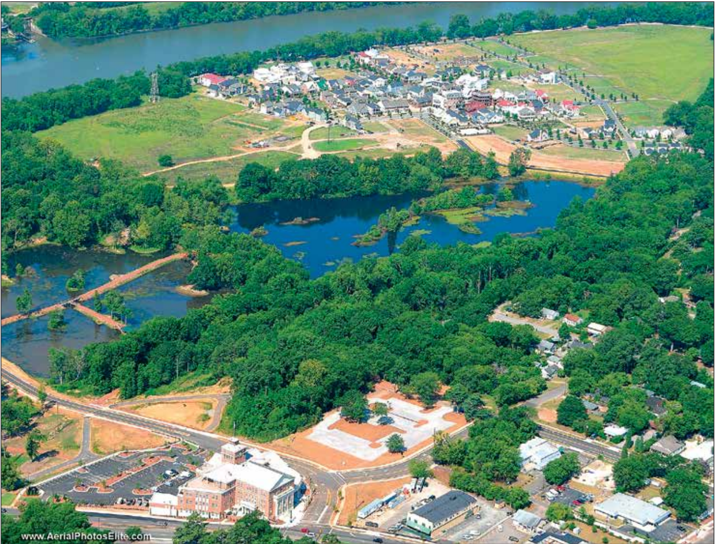
Savannah River/North Augusta